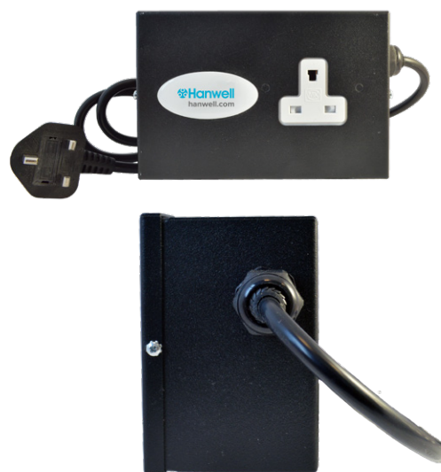
Product code: HPS-03 and HPS-04

HPS-04 Slave unit. Need slave cable 4 pin to pin